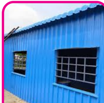
Terrace Roofing Shed Starting @ ₹199 / Sqf