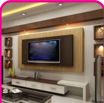
Modular TV Unit Starting @ ₹19999