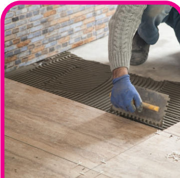
Tiles Fixing Starting @ ₹129 / Sqf

Renovations Painting Electrical Plumbing Carpentry Fabrication Water Seepage Tiles & Granite Fixing