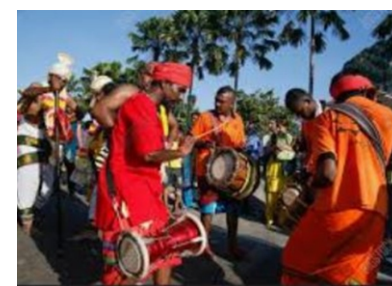
At the Thaipusam festival in Kuala Lumpur, Malaysia.

and many others. The urumi may also be heard on commercial recordings of film soundtracks and popular folk music.