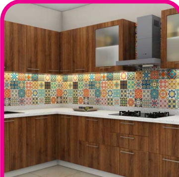
Modular Kitchen Starting @ ₹149999

Wall Covering Floorings Furnishing Mattresses Headboards Curtains Blinds Rugs & Carpets