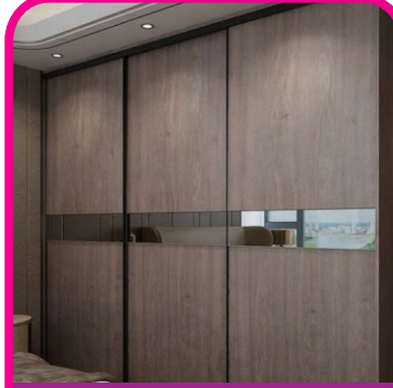
Modular Wardrobes Starting @ ₹49999