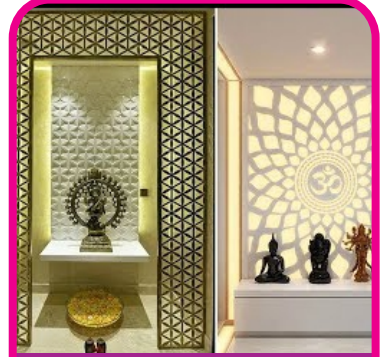
Modular Pooja Unit Starting @ ₹29999