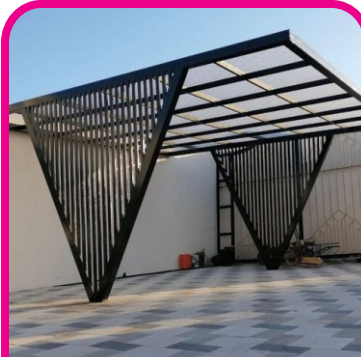
Terrace Pergola Starting @ ₹1599 / Sqf