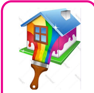
House Painting Starting @ ₹14 / Sqf